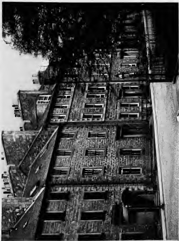
25. GEORGE SQUARE. EDINBURGH